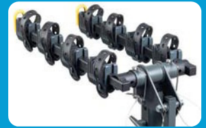
Easily Adjustable Rack Arms