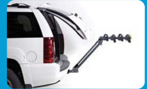
Patented Parallelogram Design