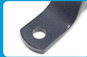
Rugged Powder-Coated Steel