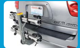
Folds Up When Not In Use