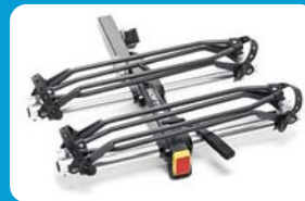
Compact When Not In Use